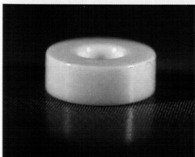
A CIM valve seat produced by Adamou Sàrl

Adamou Sàrl of Etoy, Switzerland, is using ceramic injection moulding (CIM) to produce a sintered valve seat from 99.9% alumina powder. The company states the ceramic seat is used in